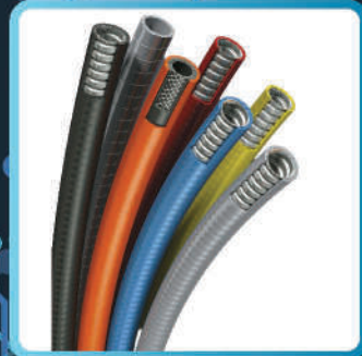
JACKETED METALIC CONDUIT