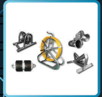
CABLE PULLING EQUIPMENTS