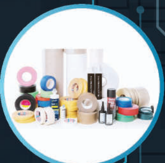
TAPES & ADHESIVES