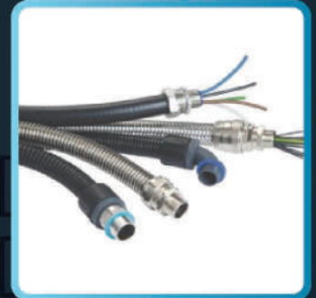
GI FLEXIBLE / PVC GI / METAL