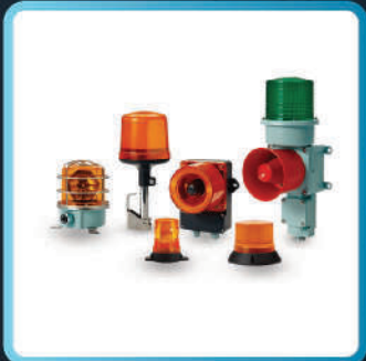
ALARM & WARNING LIGHTS