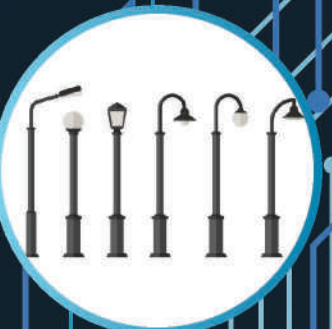
STREET LIGHT POLES