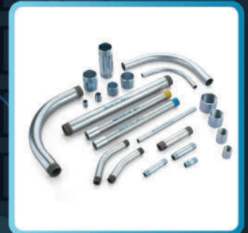
GI & EMT PIPES ACCESSORIES