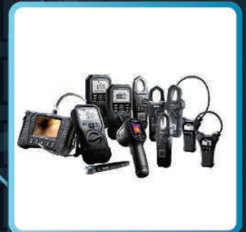
MEASUREMENT & INSTRUMENTATION