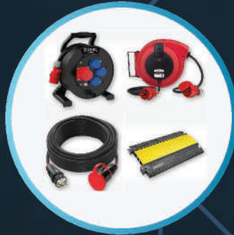
INDUSTRIAL CABLE REELS & EXTENSION CORDS