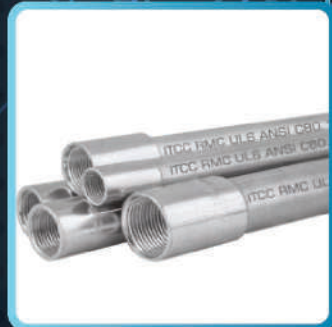
RIGID STEEL CONDUIT : RGS/HDG/SS/AL CONDUITS