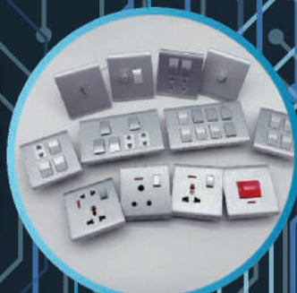
SWITCHES AND SOCKETS