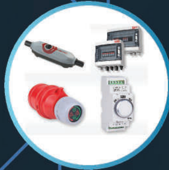
PROTECTING TESTING EQUIPMENT