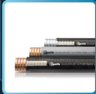
EMI RFI SHIELDED