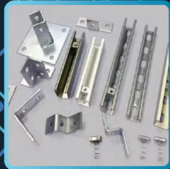
UNISTRUT CHANNELS & ACCESSORIES