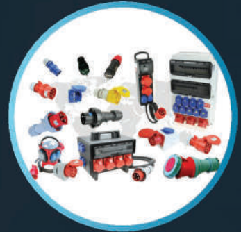
INDUSTRIAL SOCKETS PLUGS