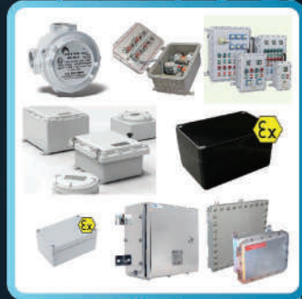
EXPLOSION PROOF JUNCTION BOXES