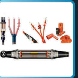
POWER CABLE TERMINATIONS LV/ MV/ HV