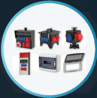
DISTRIBUTION BOXES POWER DISTRIBUTION

We take pride in offering a diverse selection of premium electrical products tailored for industrial and commercial applications. With a focus on innovation and customer service, we are committed to providing the resources you need to elevate your projects and streamline your operations. Partner with us for reliable electrical solutions that empower your success. Our portfolio features an array of solutions, including following: