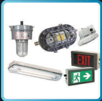
EXPLOSION PROOF LIGHT FITTING