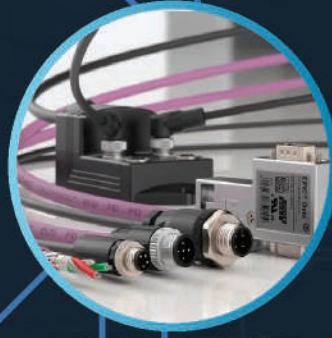
INSTRUMENTATION & COMMUNICATION CABLES