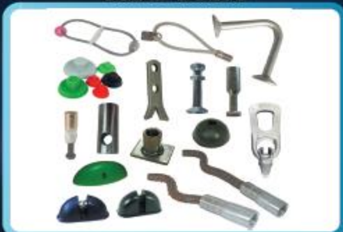
LIFTING & FIXING PRODUCTS