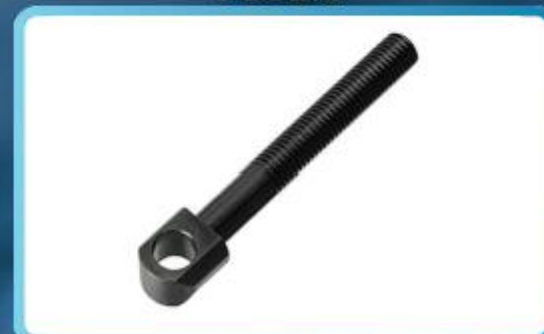
PRECISION ENGINEERING MOULDS AND COMPONENTS