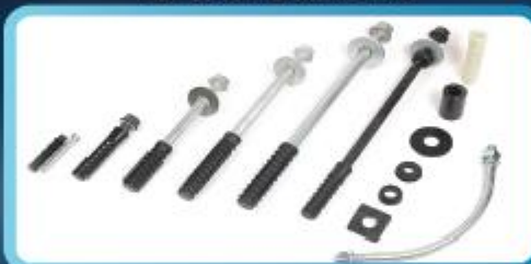
TUNNEL SEGMENT BOLTS