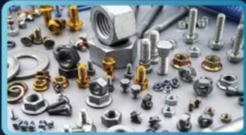
FASTNERS: GI/ HDG/ SS